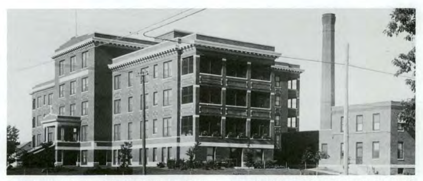
St. Alexius Hospital occupied its new building on 9th Street between Broadway and Thayer Avenues in Bismarck in 1915. Note the screened porches and the adjacent powerhouse and laundry.

Nursing at this time was admittedly primitive by today's standards. The nurses were taught loyalty to their physicians, hospital, and school, all of which were supposedly dedicated to the healing of the sick and the betterment of mankind. All phases of hospital work were within the nurse's bailiwick: housekeeping, dietary, admitting and discharging of patients, as well as all the handling and care of everyday life for the patient. In addition to some of the more mundane duties, the nurse was expected to know a doctor's preference in terms of dressings, positioning, medications, as well as the instru-