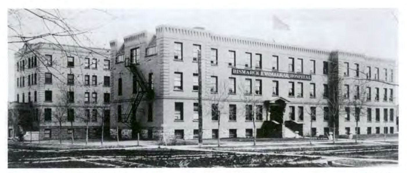
The "German Evangelical Hospital" rapidly became identified as "Bismarck Hospital" after it opened in 1908. The photograph is not dated, but shows the facility after the 1917 addition.

World War I temporarily diffused much of the animosity between the two hospitals. Many of the regular staff, medical as well as nursing, were either in Europe or performing service in the United States. Both hospitals worked with skeleton staffs, making much use of the student nurses.