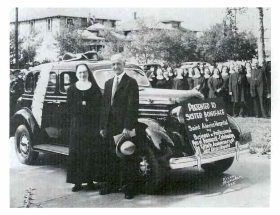
Copyright © 1986 by the State Historical Society of North Dakota. All Rights Reserved.

-Courtesy Annunciation Priory Archives, Bismarck