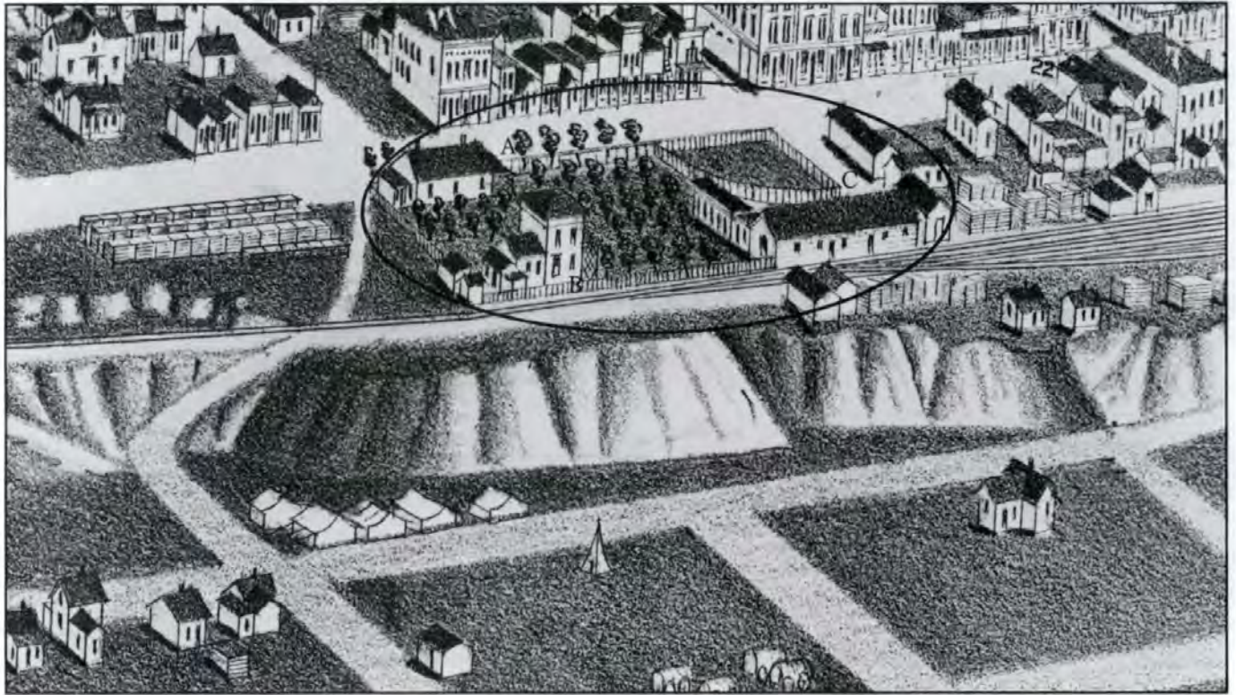
Close-up of Camp Hancock in 1883. The letter A indicates the Quartermaster's and Signal Corps offices, B is the original commanding officer's quarters vastly altered, and C is a warehouse. Tents below the terrace were probably for military personnel in transit.

Northern Pacific's engineering party, then surveying the Yellowstone River Valley. 45 By autumn of 1873, Camp Hancock, although planned for only limited duration, was an established and well settled post, albeit one of decidedly spartan facilities.