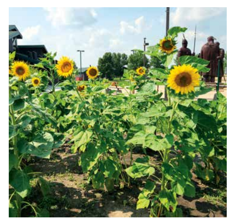
Arikara sunflowers in the First Farmers garden at the Lewis & Clark Interpretive Center in Washburn offer a colorful hello to visitors. The garden, which represents a microcosm of Indigenous crops, is one of three planted by staff at the site.

Summer at North Dakota's state historic sites means getting outside and communing with the land. And what better way to do that than with a paintbrush or trowel in hand? From plein-air art to gardens featuring historically accurate plants, here are a few examples of the aesthetic and edible bounty you'll find right on our doorsteps.