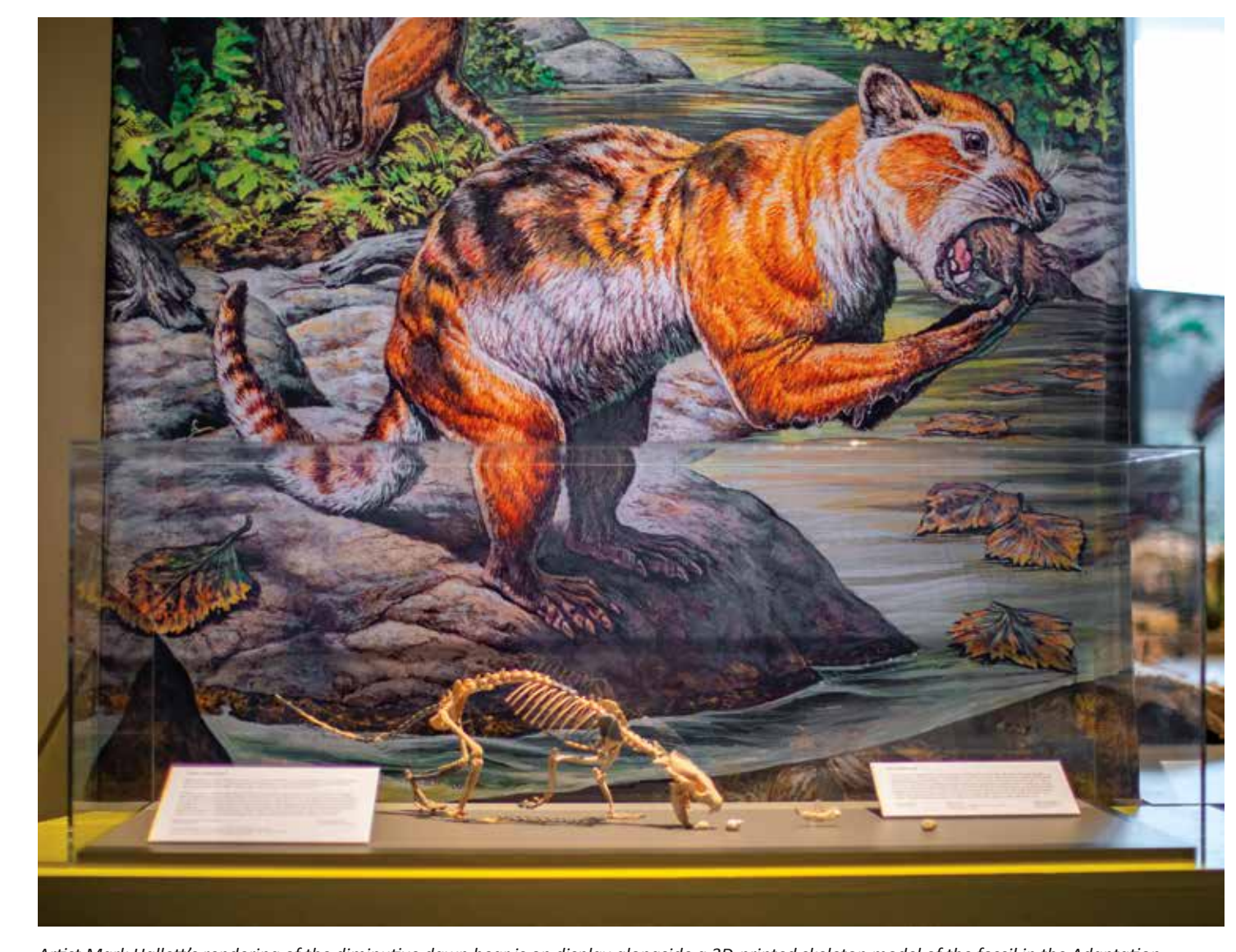
Artist Mark Hallett's rendering of the diminutive dawn bear is on display alongside a 3D-printed skeleton model of the fossil in the Adaptation Gallery: Geologic Time.

With claws similar to a cat's and resembling a racoon, the 30-inch long Eoarctos could easily climb trees but moved slowly on the ground. The extinct animal could crush hard materials such as snail shells in its mouth, though evidence of broken teeth and jaw bones suggests it wasn't always quite up to the task, said Boyd. "It probably died either from the severe jaw infections or from starvation, as the infections would prevent it from eating."