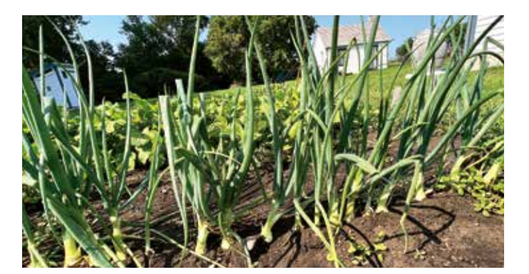
Late July onions in the Gemüsegarten (vegetable garden) at the Welk Homestead State Historic Site near Strasburg. Bilingual plant markers in the garden reflect the Welks' German-Russian heritage.