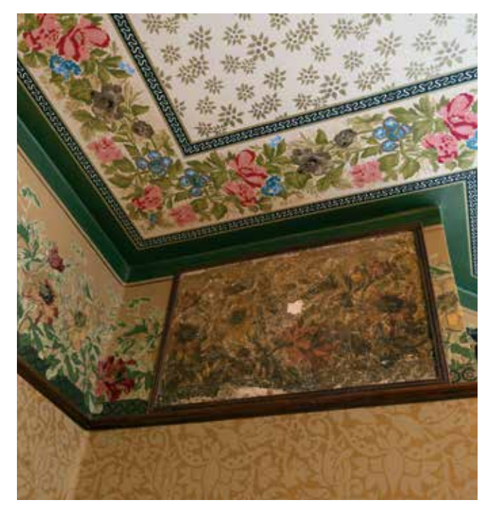
Corner of the Former Governors' Mansion parlor showing reproductions of the five different 1884 wallpapers. A framed section preserves an example of the original paper.

Now that the parlor walls have been restored to their former glory and new lace curtains are in place, plans are underway for updated and expanded interpretation and periodappropriate wall hangings. Ultimately, Campbell would like to redo the entire mansion with accurate wallpaper designs from different eras in its history, allowing visitors to move through time as they ascend each floor of the two-and-a-half-story Victorian.