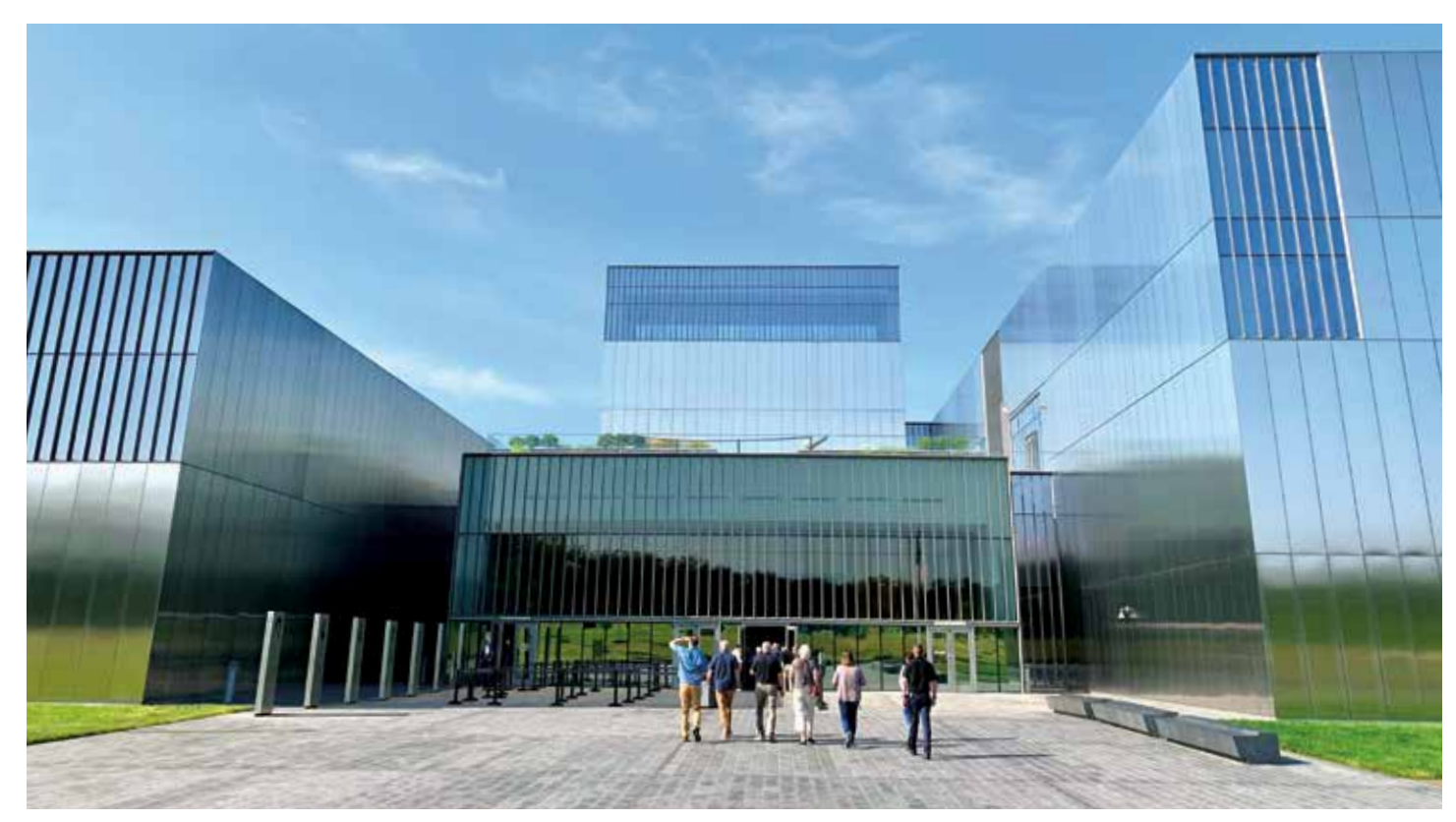
Members of the Joint Military Museum Advisory Committee tour the National Museum of the United States Army in Fort Belvoir, Virginia.

Plans to add a military wing to the ND Heritage Center & State Museum in Bismarck continue to advance. The agency and the North Dakota National Guard have signed a memorandum of agreement to create the addition, which Fargo-based Zerr Berg Architects will design. In June, the newly formed Joint Military Museum Advisory Committee, consisting of representatives