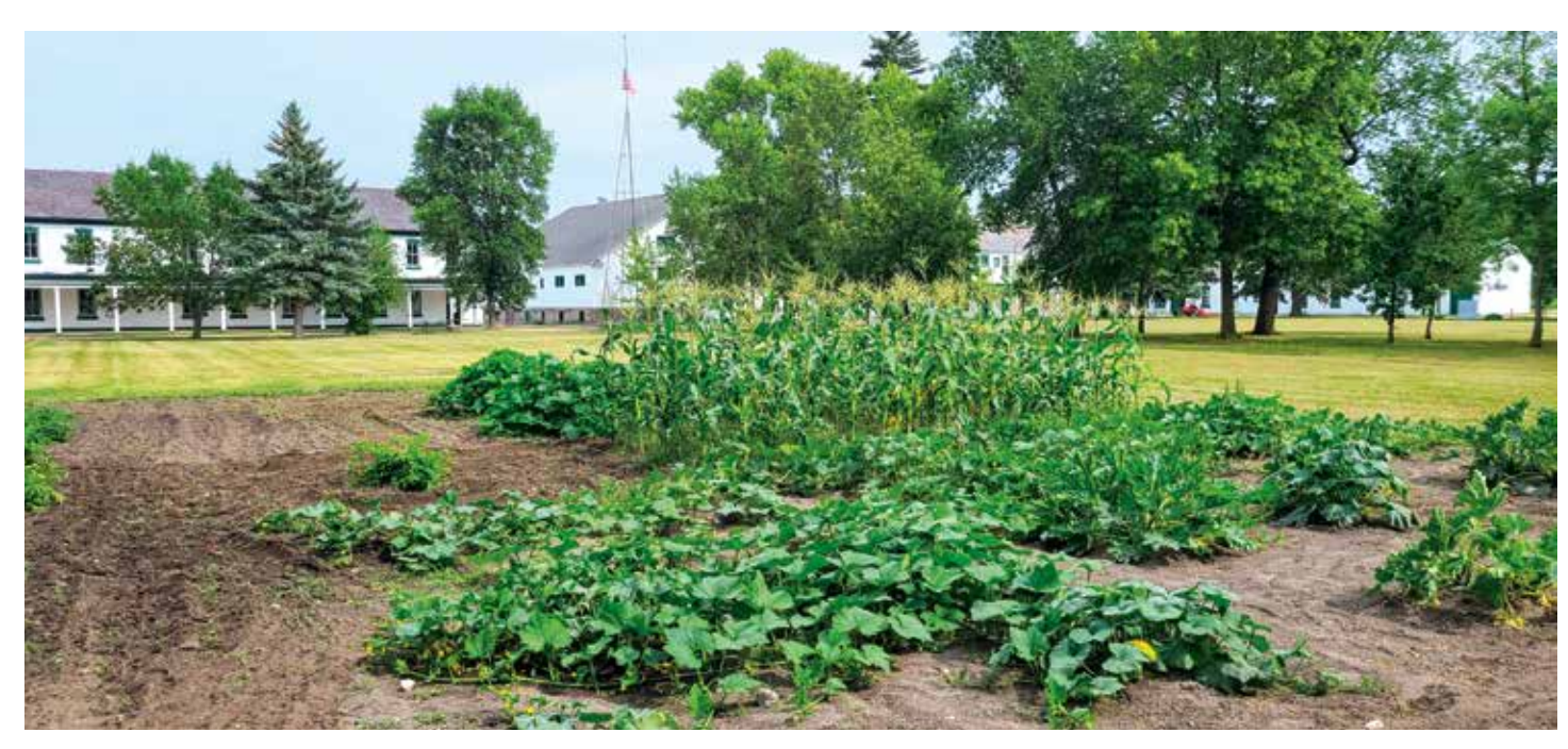
Corn, pumpkins, cabbage, potatoes, and summer squash are among the bumper crops found in Fort Totten State Historic Site's victory garden. Each spring, agricultural students at Cankdeska Cikana Community College till the garden. This year members of the local 4-H chapter were also on hand to help staff with the planting. Produce from the garden is donated to the Hope Center food pantry in Devils Lake.