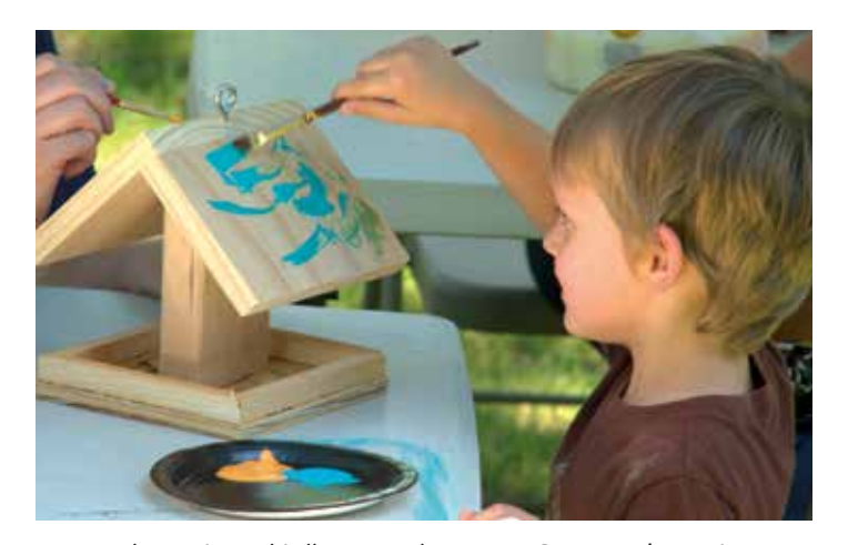
A young boy paints a birdhouse at the Former Governors' Mansion State Historic Site during an event for families in August.