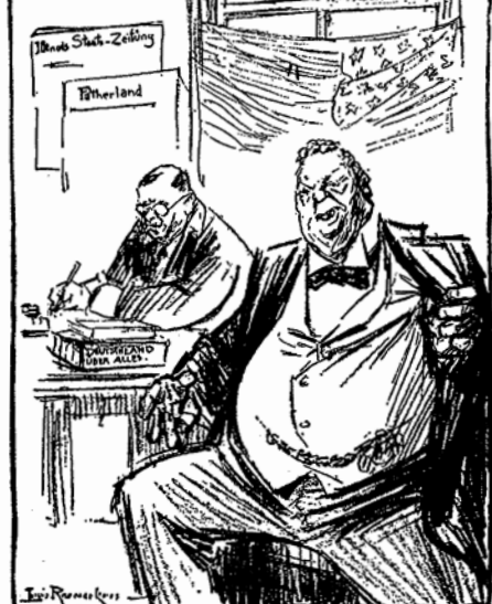
In the office of a German newspaper in America

"My tear vellow, do not forget to wave now and again a leedle American flag, but keep on with the good work of poisoning the people's minds"