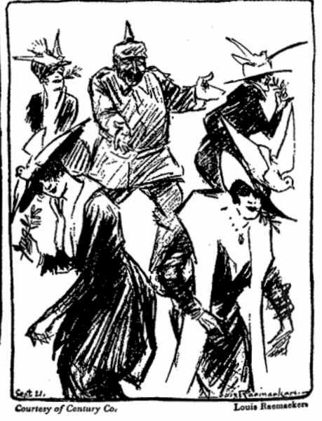
"Go, my peace doves to my enemies, your charms may prove more fatal than my armies."

"My tear vellow, do not forget to wave now and again a leedle American flag, but keep on with the good work of poisoning the people's minds"