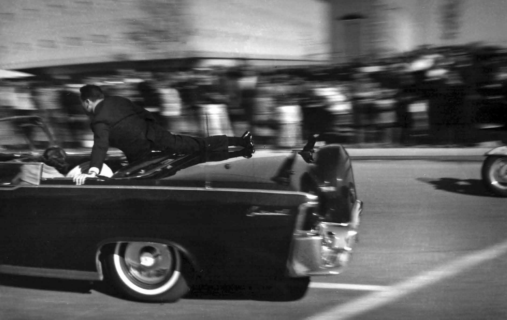
US Secret Service agent Clint Hill climbed onto the presidential limousine and draped himself across the president and first lady as the vehicle sped to Parkland Hospital in Dallas.

bullet, scattering blood and bone fragments across Hill's face, his dark suit, the vehicle's interior, the trunk, and the first lady's pink suit. Hill scrambled to get his footing and pull himself onto the moving limo. Meanwhile, Mrs. Kennedy was on her hands and knees climbing onto the trunk. Seeing her on the back of the moving vehicle, Hill was worried the first lady would "go flying off the back of the car." Mrs. Kennedy was in shock, according to Hill. "She was trying to retrieve some brain matter off the rear of the trunk. She didn't even know I was there," he says.