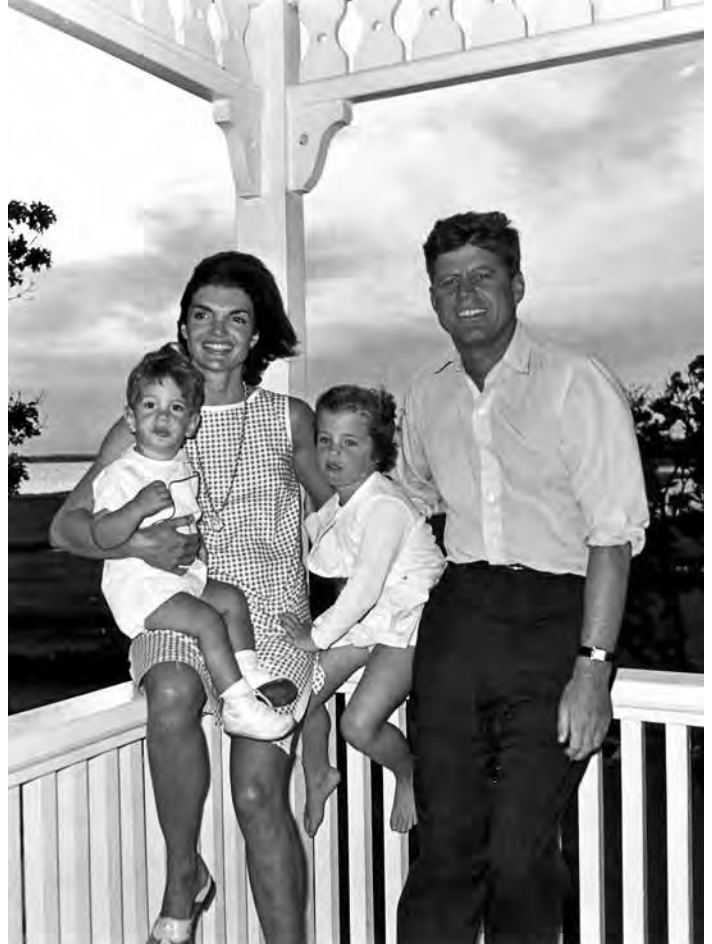
President Kennedy, First Lady Jacqueline Kennedy, and John and Caroline at Hyannis Port, August 4, 1962.