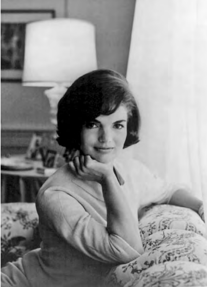
The first official White House portrait of Jacqueline Kennedy, taken in early 1961