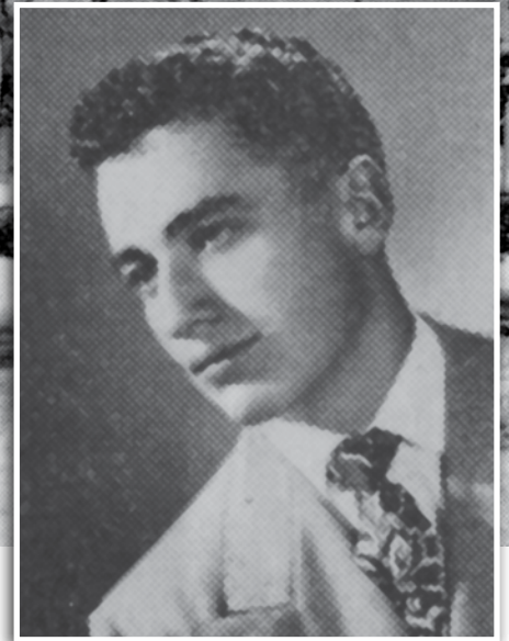
Clint Hill attended school in Washburn, North Dakota, graduating from high school in 1950. Among other activities he was a member of the student council (second from left) and played basketball (front, third from right), as well as other sports.

In 1954 Hill graduated from Concordia College in Moorhead, Minnesota, with degrees in physical education and history. He entered military service after college and trained at the US Army Intelligence Center as a special agent in counterintelligence. Hill's goal was to become a secret service agent. With no openings available, he found work as a detective for a time. In September 1958 he was offered a Secret Service position in Denver, Colorado. Hill was thrilled, as the Secret Service "was difficult to get in," with only 269 agents in the country. Less than one year later, Hill was assigned to President Dwight Eisenhower's Secret Service detail, spending his time either with the president or on call, ready to protect him at a moment's notice. "We all really respected President Eisenhower and had a great time," says Hill, who shared a tight-knit camaraderie with the other agents.