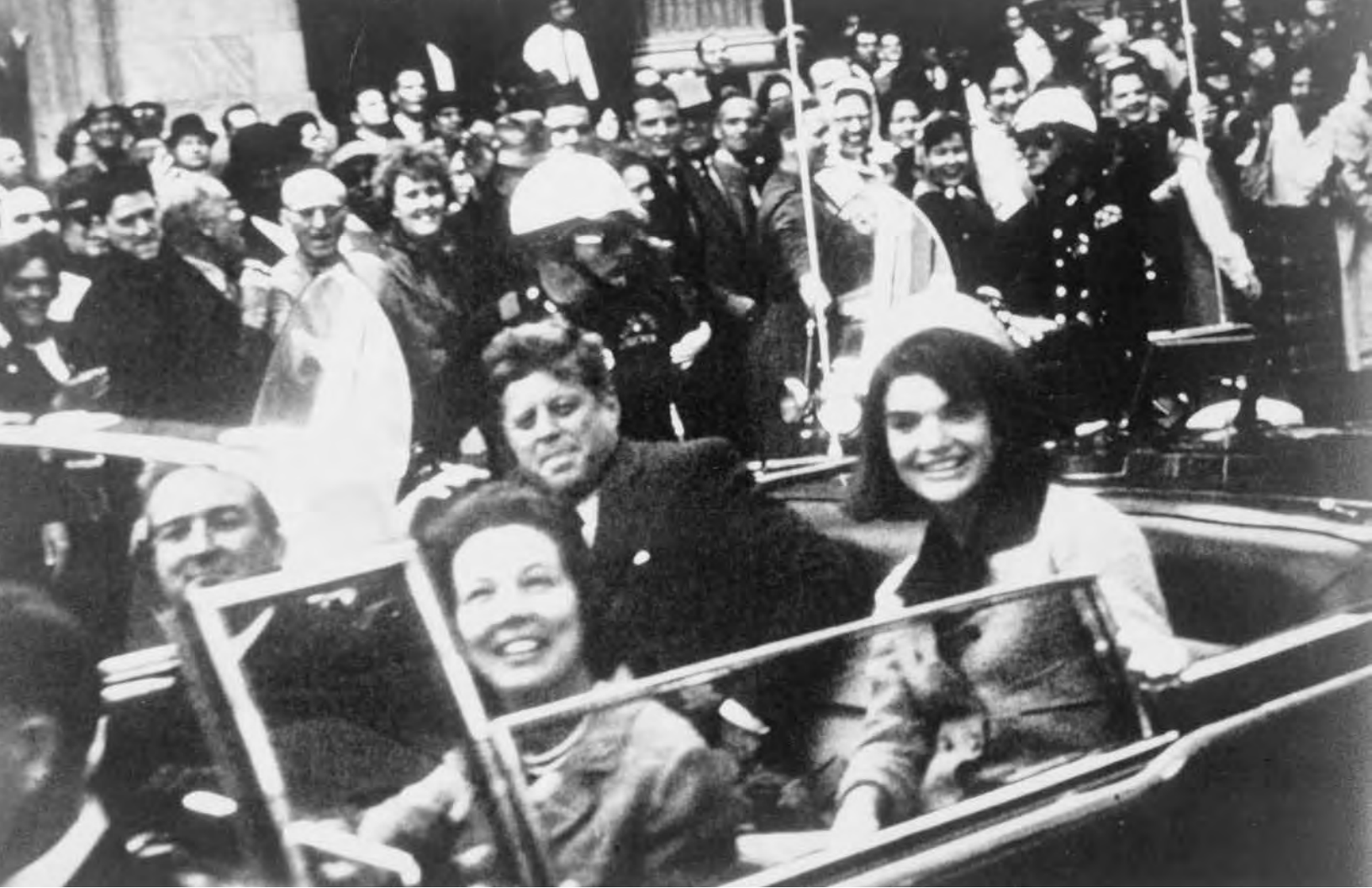
Texas Governor John Connally and his wife, Nellie, were seated ahead of President and Mrs. Kennedy in the limousine departing from the Dallas airport on November 22, 1963.

luncheon at the Trade Mart, where President Kennedy planned to deliver a speech to about 2,600 people who had purchased tickets.