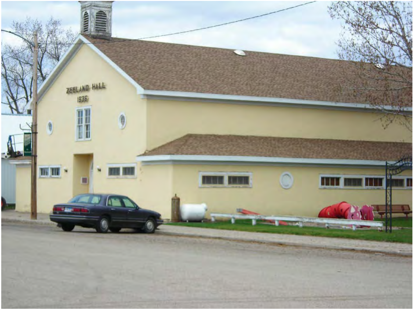
9 – From southwest after recent shingle replacement