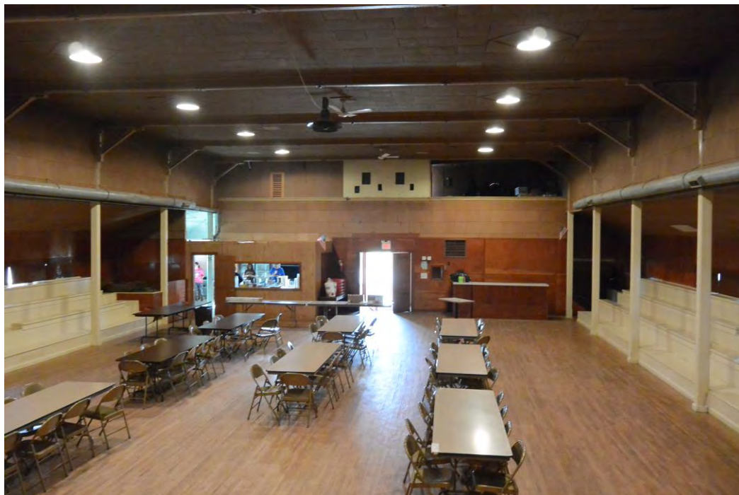
8 - Interior of hall, from east (from the stage)