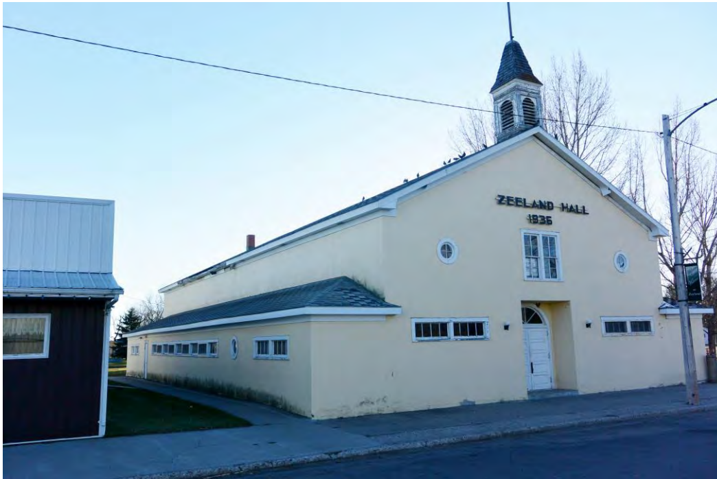
5 - Northwest corner of hall, from northwest