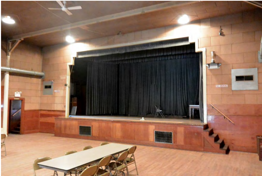
7 - Interior of hall, from southwest