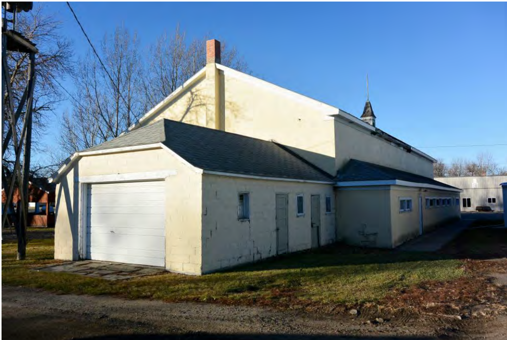
4 - Northeast corner of hall, from northeast