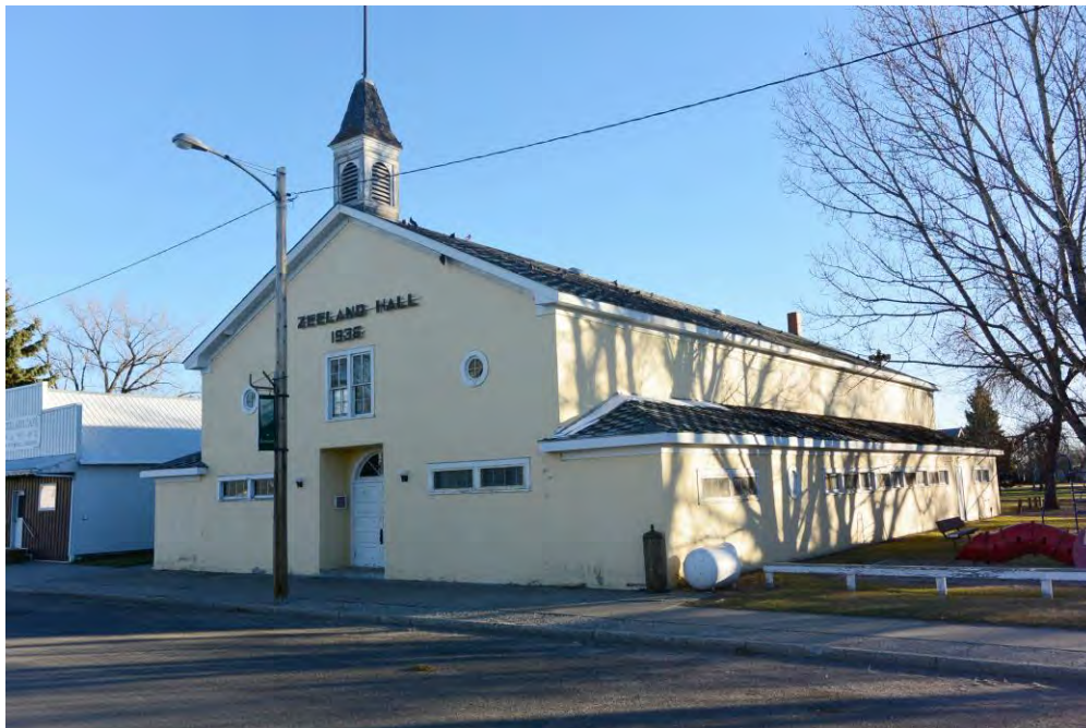
2 - Southwest corner of hall, from southwest