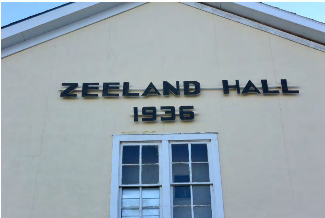
6 - Front gable of hall, from west