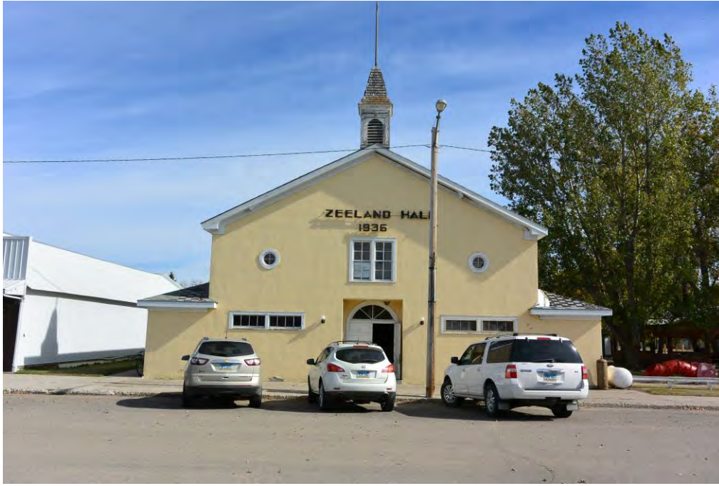
1 - Front of hall, from west