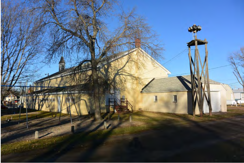
3 - Southeast corner of hall, from southeast