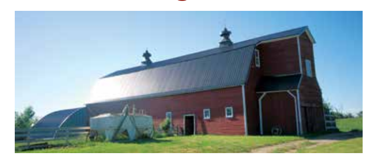
The Schlafmann Barr

The Schlafmann Barn near Turtle Lake was recently listed in the National Register of Historic Places. The National Register is the federal government's list of properties it considers worthy of preservation and recognition. North Dakota nominations are coordinated by the State Historical Society.