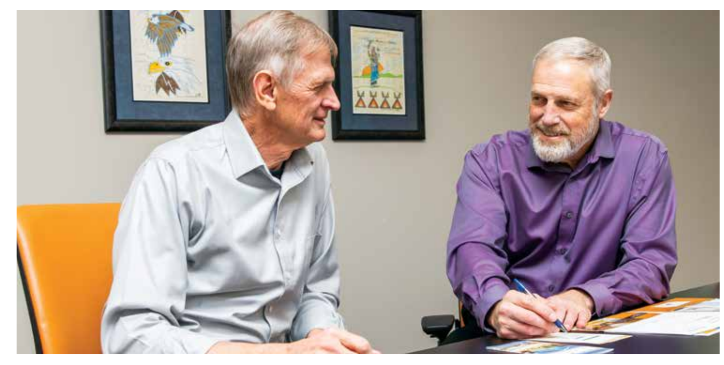
To learn more about how you can support the Foundation, drop by and say hello—we'd love to meet you! Our offices are in the ND Heritage Center & State Museum on the Capitol grounds in Bismarck.

If you are looking for ways to ensure our state's historical legacy, here are three retirement account giving options that can benefit both you and the State Historical Society of North Dakota Foundation.