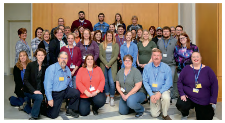
State Historical Society staff hosted 35 teachers at the ND Heritage Center & State Museum for a two-day North Dakota Studies workshop in October.

American Essential Understandings developed for North Dakota schools. State Historical Society staff and guest presenters covered topics from web-usability to historic site visitation to museum interaction, not to mention archival research, public broadcasting, biopics, energy, and early people groups.