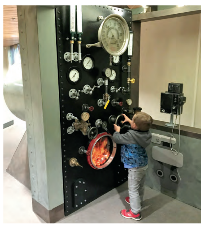
The train in The Treehouse children's exhibit received a new interactive panel for conductors in training.

Check out the updated website at ndstudies.gov. In 2019, look for more exciting educational programs coming to life at a state historic site near you.