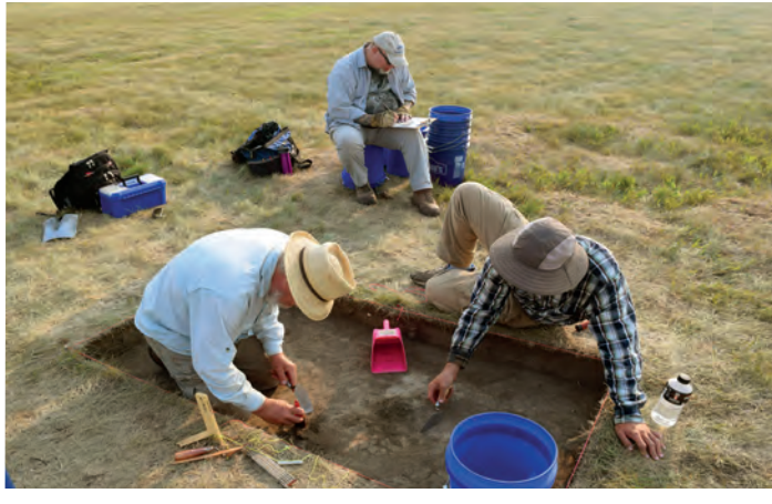
Archaeologists excavate the Molander Indian Village site, occupied by the Awaxawi Hidatsa through the mid-18th century.