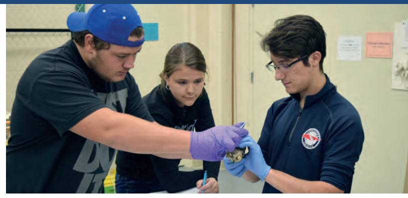
University of Mary ornithology students measure an owl from the State Historical Society collections.

An ornithology class at the University of Mary in Bismarck visited the ND Heritage Center multiple times this fall to study the State Historical Society bird and egg collections. After conducting lab work measuring specimens and examining identifying characteristics, the students completed a service project to verify the identification of a group of water birds. This project will be helpful in updating the cataloging information for our natural history collections. View select bird specimens on display in the permanent Birds of North Dakota exhibit in the State Museum.