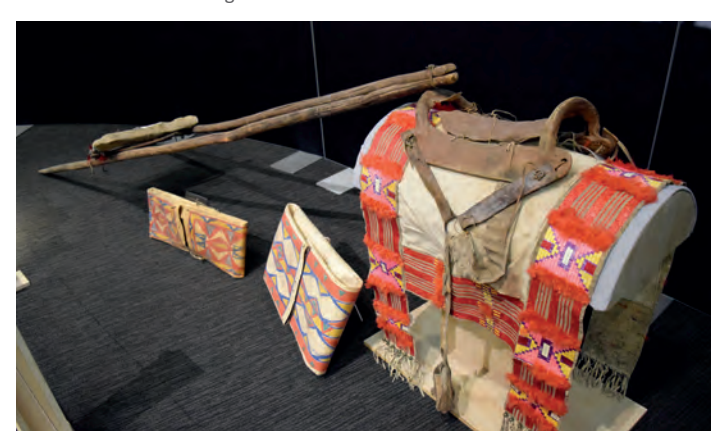
Dakota parfleche bags, saddle, and travois are now on display in The Horse in North Dakota exhibit in the Governors Gallery.