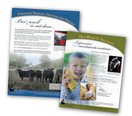
Annual Campaign Request for Support