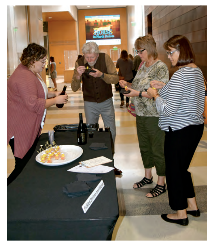
HARVEST attendees sample locally sourced appetizers from Terra Nomad on Sept. 13.