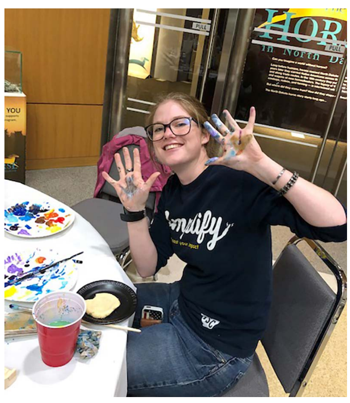
Participants in "Canvas and Cocktails: Painting Horses" show off their completed work and the creative process.